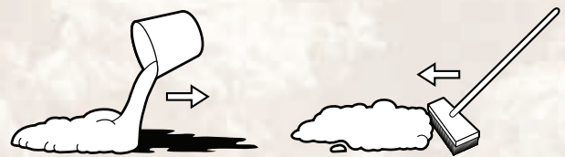
Cover spill completely. Once spill begins to clump, remove WhitZorb® and place in a separate bucket. Allow WhitZorb® to dry for reuse.

The Whitmore Manufacturing Company 930 Whitmore Drive Rockwall, Texas 75087 (972) 771-1000 www.whitmores.com