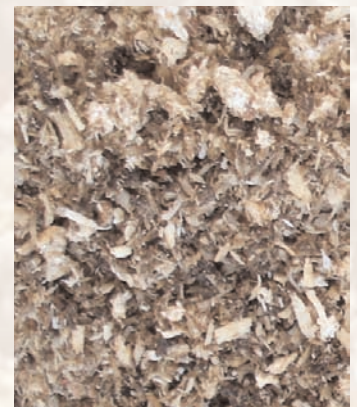
WhitZorb® After Use