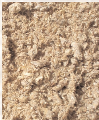
WhitZorb® Before Use

process. WhitZorb® can be reused; therefore, lasting longer than the one-time clay based materials. After absorbing a spill in the workplace, re-use as floor sweeping compound, thereby reducing the number of products to be purchased, shipped, stored and inventoried.